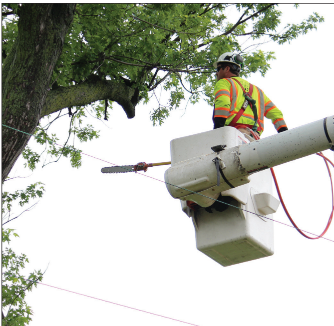
Pictured above, a crew member trims trees along N. Roherty Road in Janesville, WI.

As always, we truly appreciate the opportunity to be your energy provider and welcome your ideas about how we can improve our service.