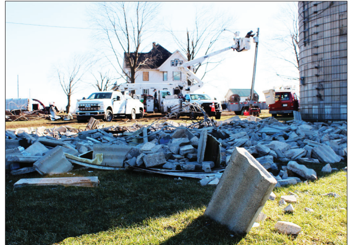
Pictured above, Rock Energy works to restore power after a tornado that touched down in southern Wisconsin in February 2024. All told, service for 458 Rock Energy members in Wisconsin was effected by the storm.

Trees also can be a power line's worst enemy. Strong winds, heavy snow, and ice can cause trees and their branches to snap, pulling down power lines and causing outages.