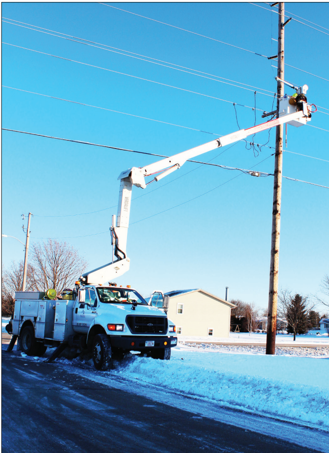
Pictured above, a Rock Energy crew works on a power line following a winter storm in Rockton, IL.

So, as winter continues to churn and cause mischief, you may see our line crews on the road as they look out for damage or potential problems with overhead lines. This is part of our normal routine to ensure that our distribution lines are in good working order. If you see our crews on the roadway, please slow down and keep a safe distance while passing them. They are working to keep our electric distribution system safe and reliable.