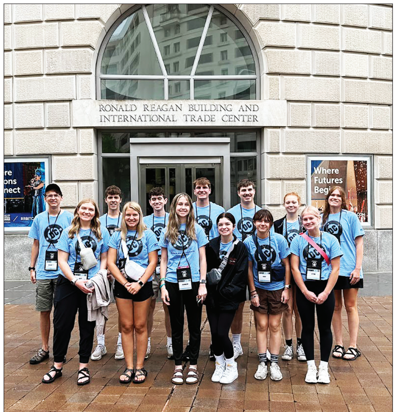
Ronald Reagan Building & International Trade Center