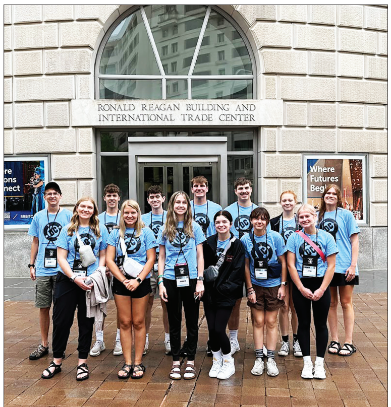
Ronald Reagan Building & International Trade Center