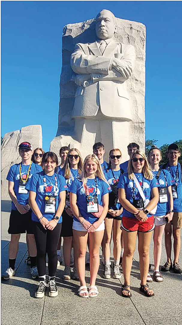
Martin Luther King, Jr. National Memorial