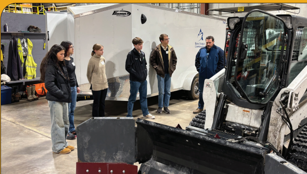
Five of Rock Energy Cooperative's youth members spent part of the morning with the cooperative's Board of Directors and CEO for a special meet and greet and facility tour in December 2025 at the co-op's Janesville, WI location.