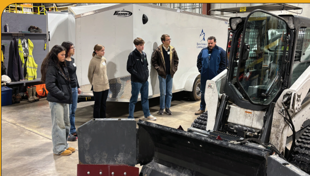
Five of Rock Energy Cooperative's youth members spent part of the morning with the cooperative's Board of Directors and CEO for a special meet and greet and facility tour in December 2025 at the co-op's Janesville, WI location.