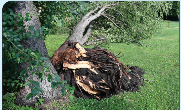
Heavy storms swept through southern Illinois in June 2025, including some Rock Energy service areas. Pictured above is a large fallen tree on Krotz Drive in South Beloit just after the storm.