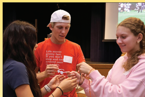
There were plenty of activities and laughs at YLC in July at UW-Stout in Menomonie, WI.