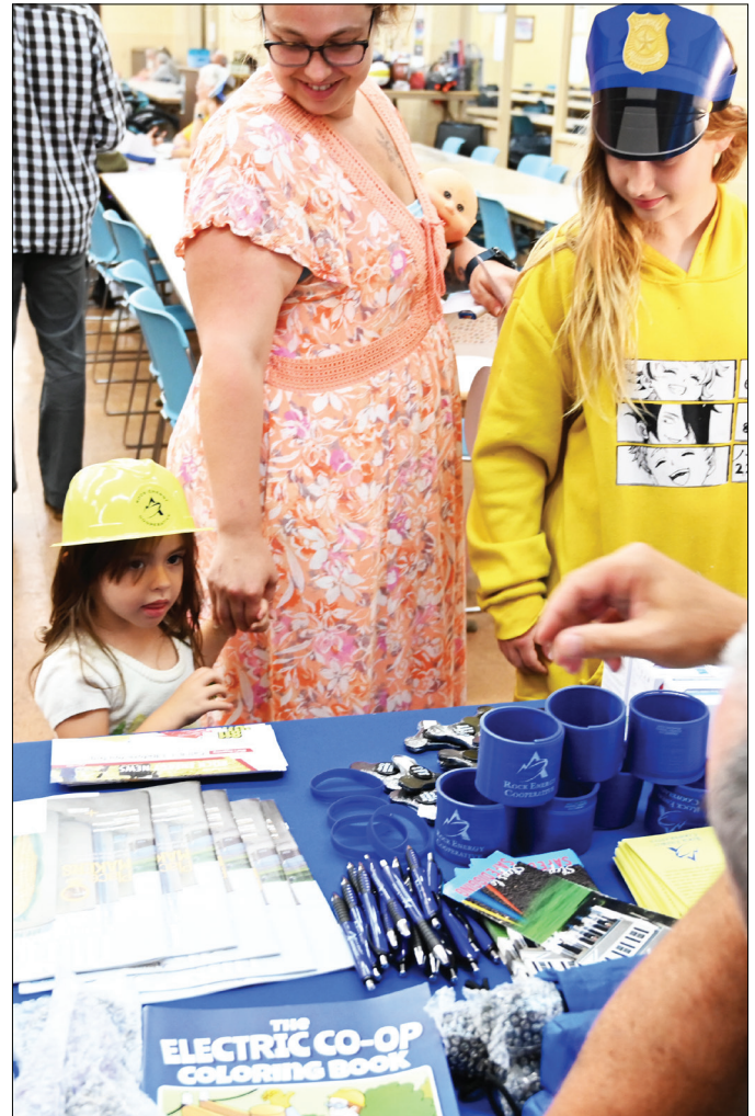
Pictured above, a young girl stops by the Rock Energy Cooperative table at the South Beloit Police Department Night Out event, which was held Aug. 6 at the South Beloit American Legion. Below, a member of the South Beloit Police Department stops by the Rock Energy table.