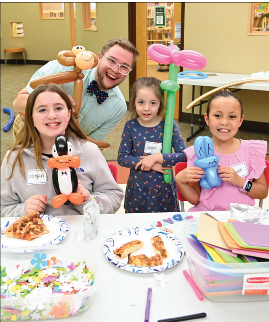
Pictured above, Rock Energy member youth enjoy pizza, games and balloon art.