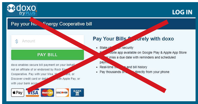
Rock Energy is NOT affiliated with DOXO.com.

If you have questions about paying bills on-line, please do not hesitate to call one of our Member Service representatives at 866-752-4550.